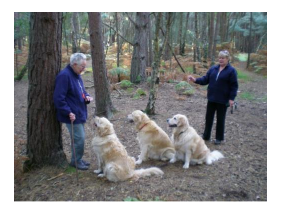
Phew! That was a jolly good walk.

Registered Charity Number 1098769 PO Box 112 Cranbrook Kent TN17 4RB