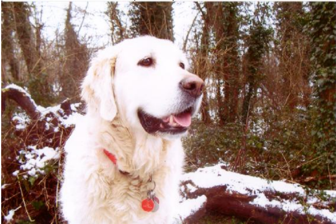
“See amid the winter’s snow”

With best wishes for Christmas and the New Year